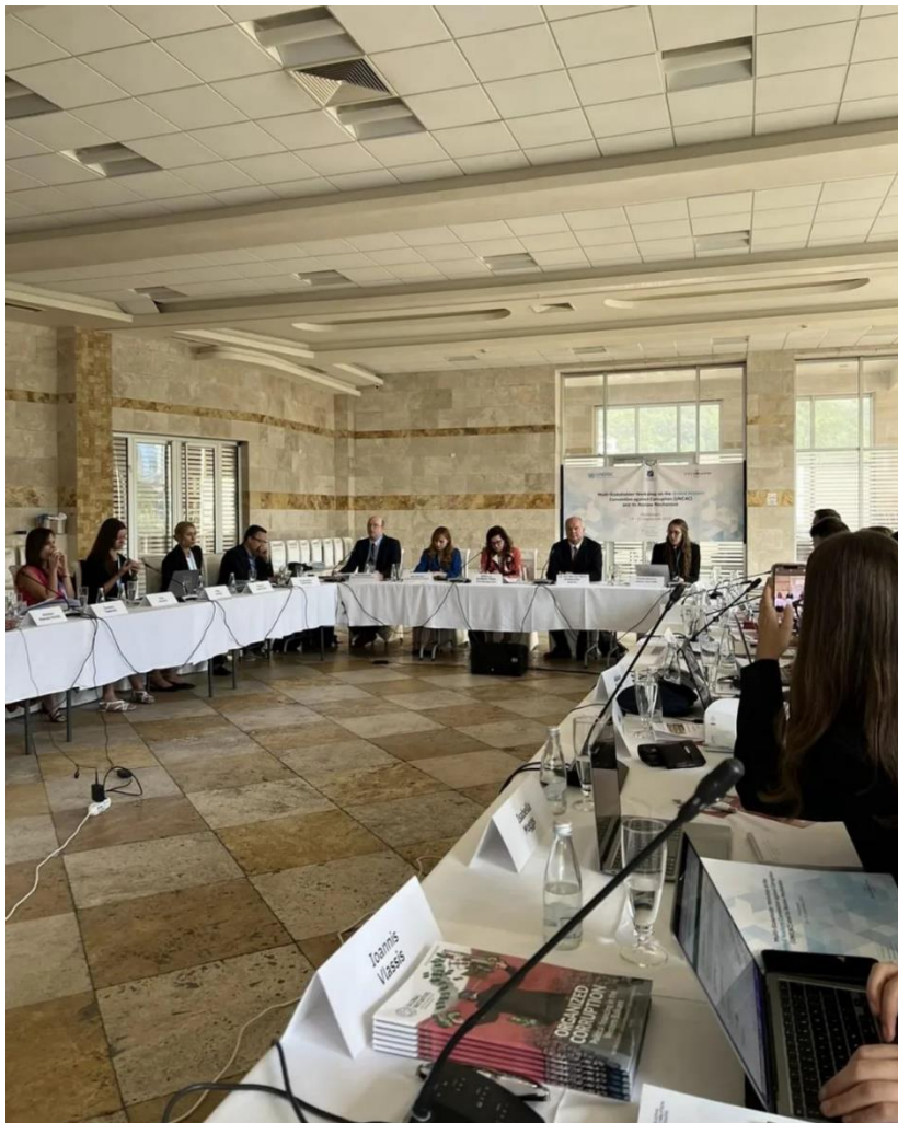
UNCAC Workshop in Becici, September 2023.

In September 2023, Partners Serbia also participated in the multisector UNCAC workshop in Becici, with the goal of establishing a dialogue between CSOs, private sector and public institutions. After the conference, Partners Serbia also formally submitted their request to be included as a member organization in the UNCAC network and are awaiting approval from the board expected in 2024.