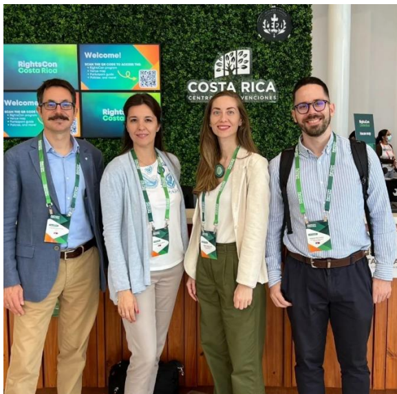
Rights Con, June 2023 – San Jose, Costa Rica

Partners Serbia also participated in Rights Con , a multi-stakeholder conference which was held in San Jose, Costa Rica, from 5 to 8 June 2023, to discuss the challenges faced in the digital world, primarily with regards to data protection and responsible use of AI.